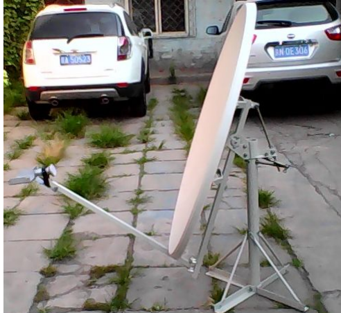
1.2m Ka antenna