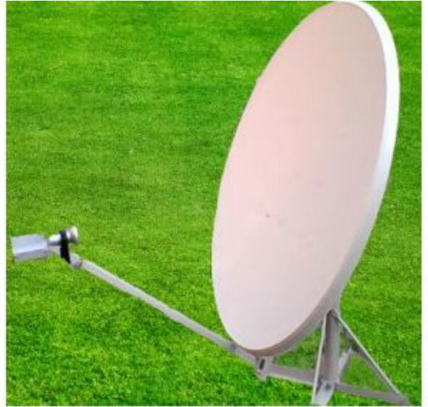
1.2m Ka antenna (2 options : simple feed arm , feed arm with transceiver plate)